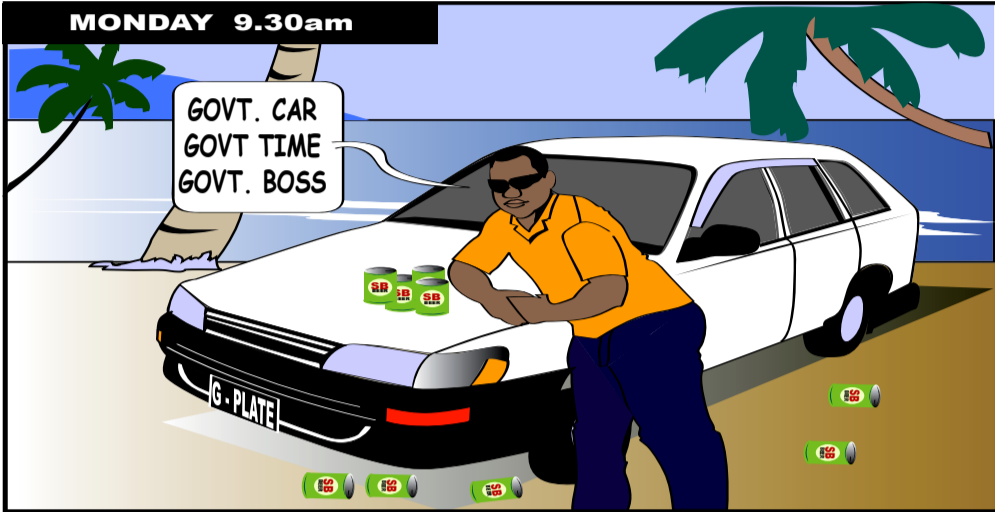
Illustration: Campion Ohasio Poster design: Studio Graphica